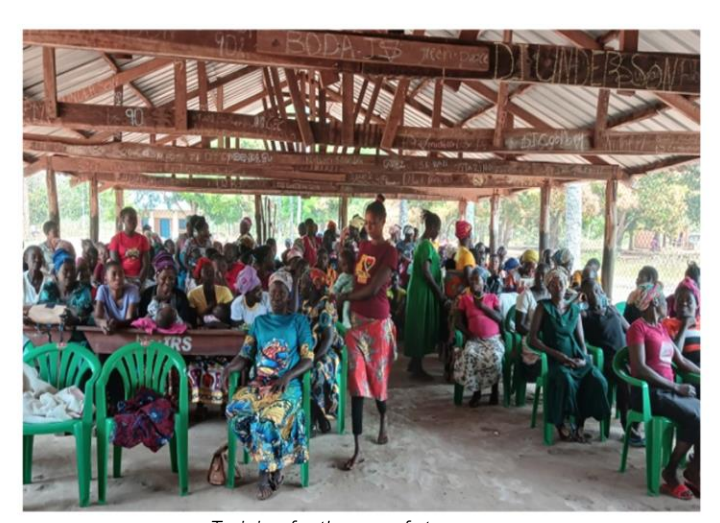
Training for the use of stoves

They consume less fuel and do not produce smoke when cooking, with obvious health benefits for the women and their families. The beneficiaries were instructed by the Solidarity project leader as to how to correctly use and maintain the stoves correctly. They were happy and grateful to receive these new improved stoves.