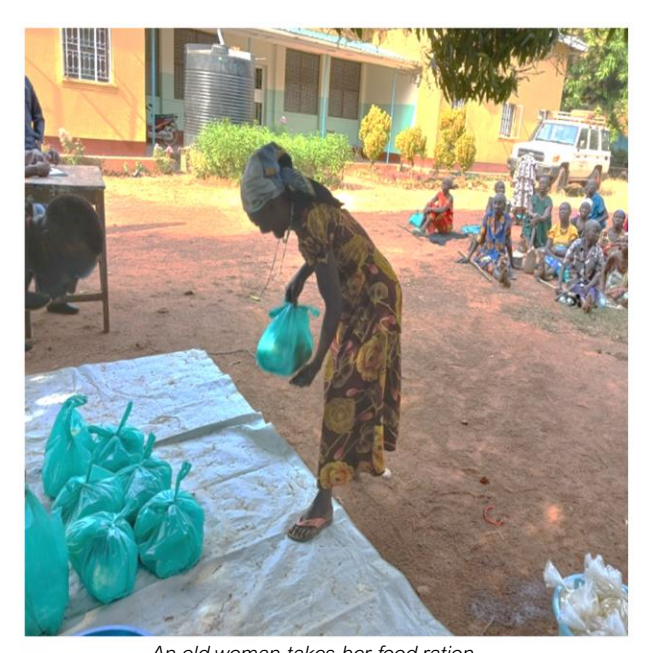
An old woman takes her food ration

The distribution of food rations to elderly people living in the area is one of the components of the sustainable agriculture project implemented by our Sustainable Agriculture Project in Riimenze. Most of the elderly we serve are extremely vulnerable, and many are blind or have other disabilities. The distribution of food is essential if they are to have a sufficiently nutritious diet. The food distributed includes flour. vegetable oil, and "pock" (meat). During the month of January 2024, about 100 elderly persons received food rations through this effort.