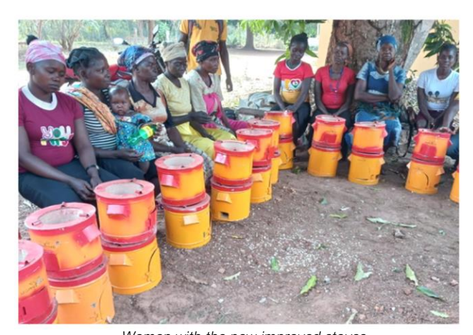
Women with the new improved stoves

Thanks to the generosity of Caritas Austria, 200 women In Riiminze received two energy-efficient stoves each, for a total of 400 stoves. One type of stove can be used with both wood and charcoal and another with charcoal only. These stoves can be used for faster cooking and they have a low environmental impact.