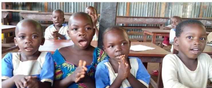
Children singing a new song