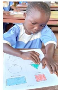
Little girl colouring shapes

At St. Paul's Nursery School in Riimenze, the pupils in the baby class are always enthusiastically engaged in learning something new. In the photo, they are learning a new song entitled "The love of Jesus is really wonderful". One of these children, whom we will call Jane (not her real name), is five years old, has a beautiful smile, is brave and takes the initiative to get things done. She pays attention in class and takes every opportunity to learn. At her age, she takes the initiative to read for herself what is written on the charts and hung on the walls using a pointer. Her father told the teacher that one day, while he was at home with his mother, he asked her: "Mum, how do you say kubaya (cup) in English?"