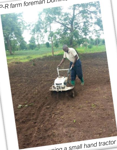
...using a small hand tractor