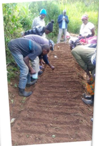
Practicing seedbed preparation