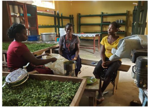
Processing of moringa powder by nutrition workers

In the nutritional processing unit of the demonstration farm of the Sustainable Agriculture Project in Riimenze, various local raw materials are processed for the production of food supplements. These include soy-nut butter, moringa leaf powder and peanut butter. These organic food additives are then distributed to the mothers of children within the SAP-R programme against malnutrition.