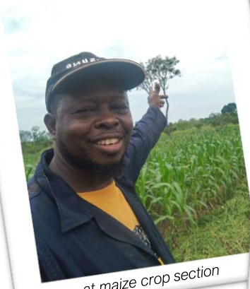
...at maize crop section