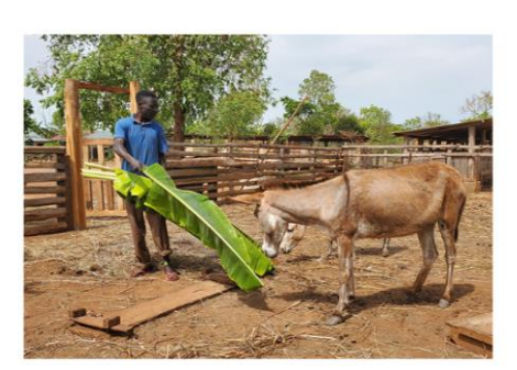
Feeding of animals at SAP-R Farm