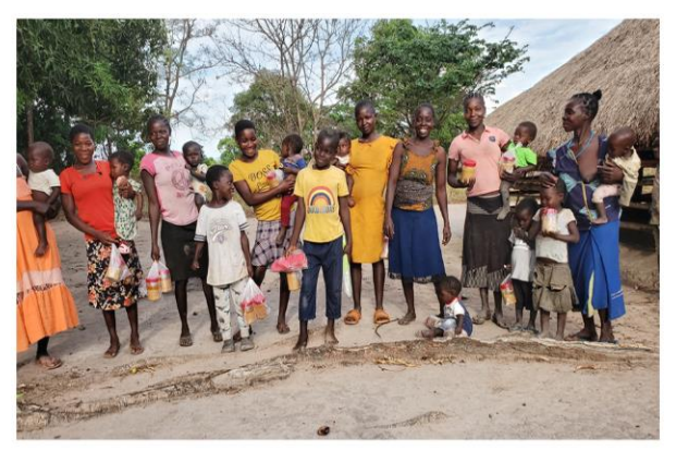
Distribution of Soy-nut butter in Makpandu