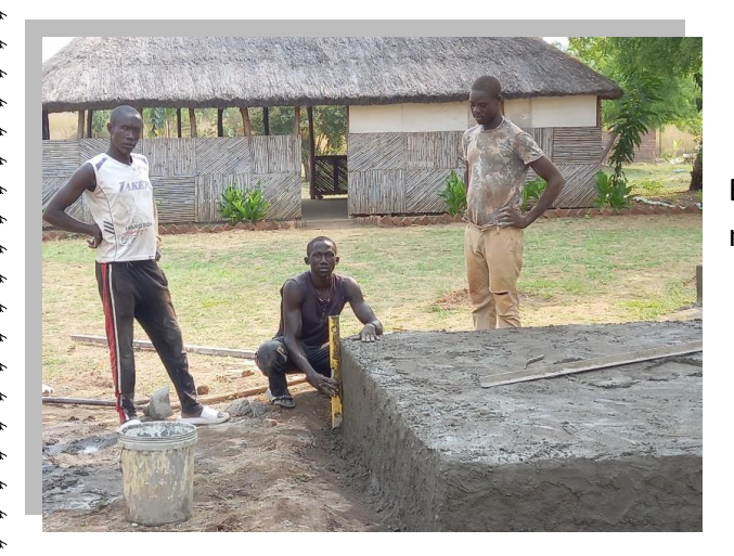
The long-awaited incinerator is almost completed.