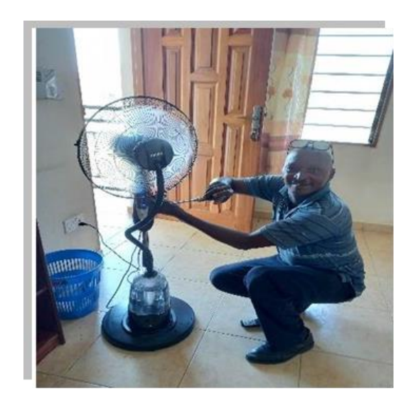
Maintenance is an ongoing requirement of the Centre.