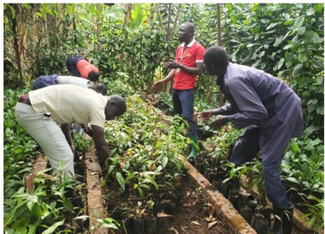
Staff working on mango seedlings

The leadership of the Solidarity Agricultural Project in Riimenze has dedicated very Wednesday as a Staff Day, during which all staff are invited to work on a specific project activity for the whole day. In the photo, staff are working on mango seedlings in the plant nursery.