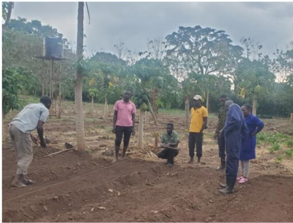
A training moment