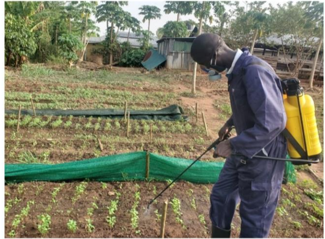
Application of organic fertiliser

As part of the sustainable agriculture project in Riimenze, a good number of vegetable nurseries were created in March 2024. In the photo, the project manager applies organic liquid manure to spray the seedlings in the farm's nurseries. Thus, the seedlings can be fully managed for healthy growth before they are transplanted into the main field. Here we do not use any chemicals to spray our vegetables and crops. We only use organic compost!