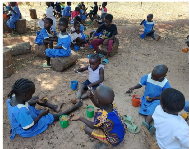
Saint Dominic Savio Nursery School children