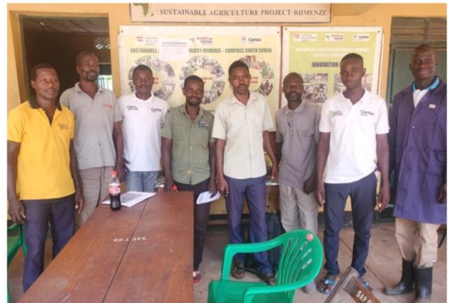
The Community Extension Workers selected

Seven Community Extension Workers were elected by community members in the six project locations and were sent to the demonstration farm for an intensive 3-day training conducted by the Livelihood Officer. The objective of the training was to prepare the workers to provide agricultural extension services to the wider farming community in their respective locations. The extension workers will train the farmers and collect agricultural production data.