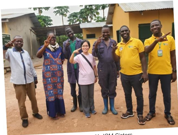
Group photo with ICM Sisters

Two Missionary Sisters of the Immaculate Heart of Mary (ICM) came from Rome to visit Riimenze. They visited the demonstration farm to observe the diversity of our agricultural endeavors. The Sisters visited all of the other sectors, such as horticulture, animal husbandry, field crops—including coffee, the banana plantation, and the nutrition section. The Sisters were pleased and impressed with the broad range of activities and enterprises underway on the farm and thanked all of the staff for their hard work on behalf of the community around Riimenze.